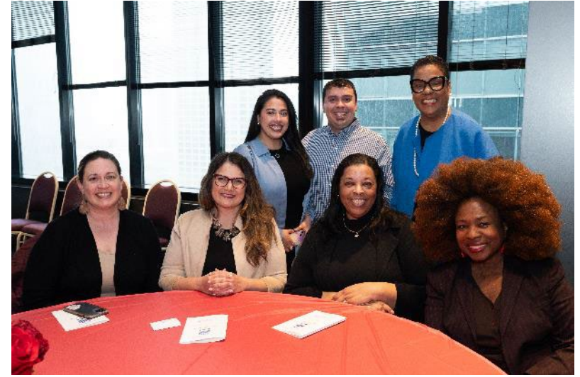
Northern Illinois University