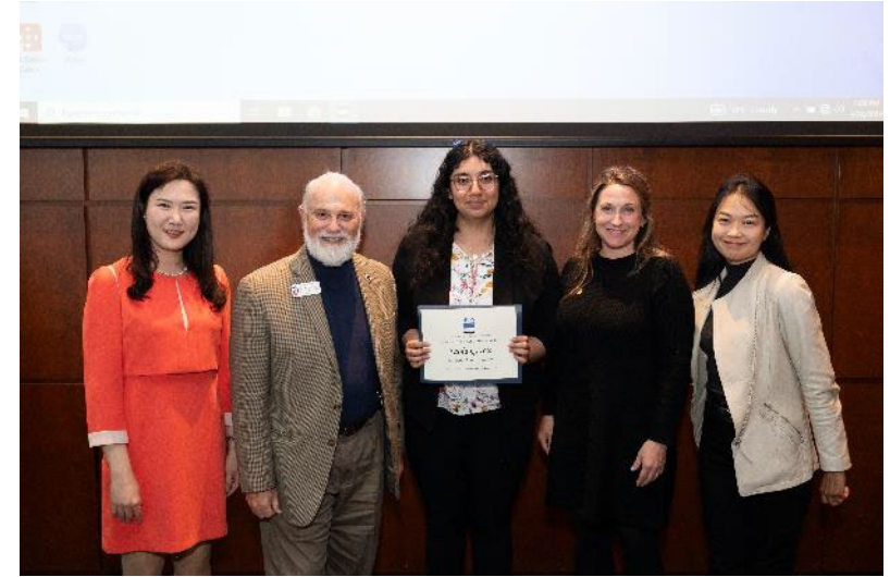
Northern Illinois University