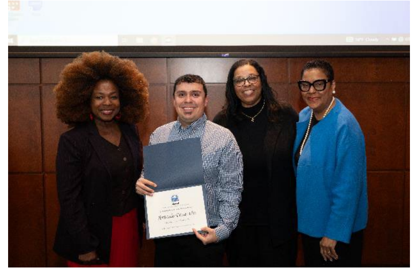
Northern Illinois University