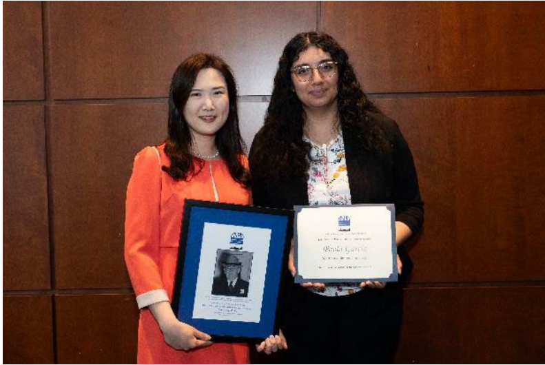
NIU Brownlow and Alumni Awardees