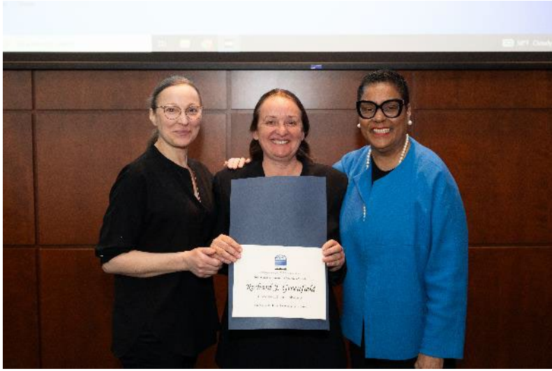
Northern Illinois University