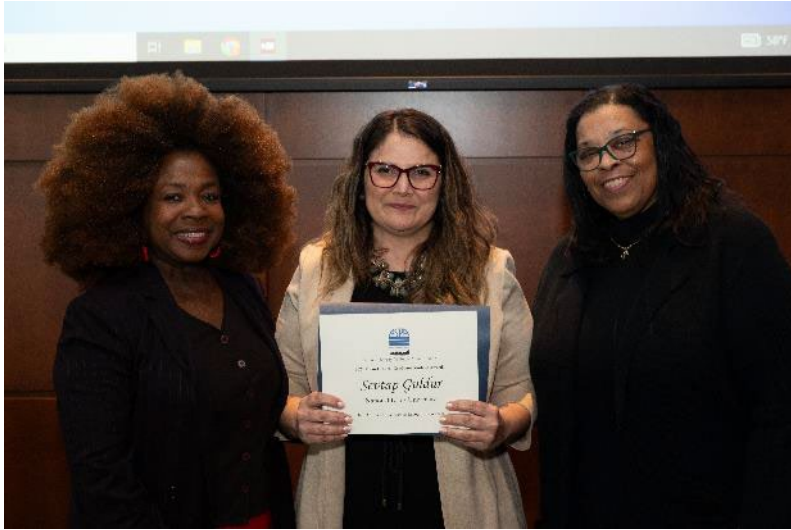
Northern Illinois University