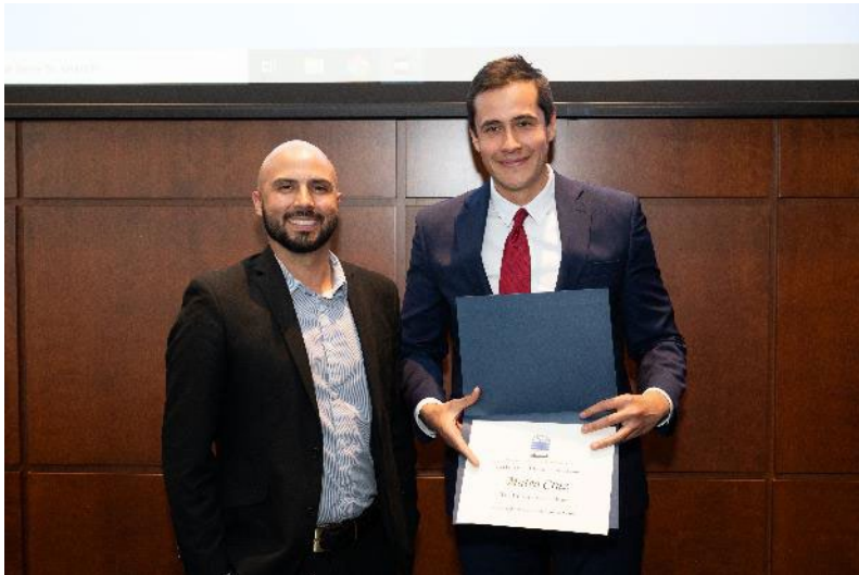
The University of Chicago