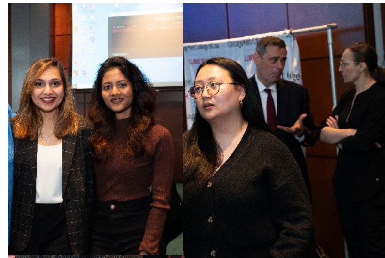
IIT Graduate Students