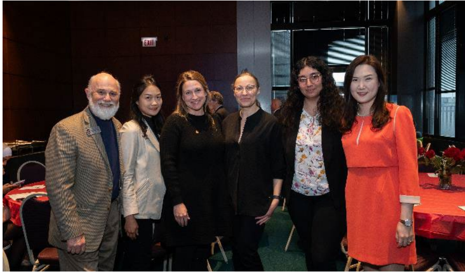
Northern Illinois University