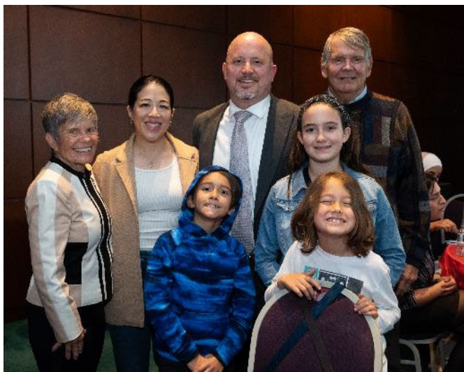
The Nellis Family